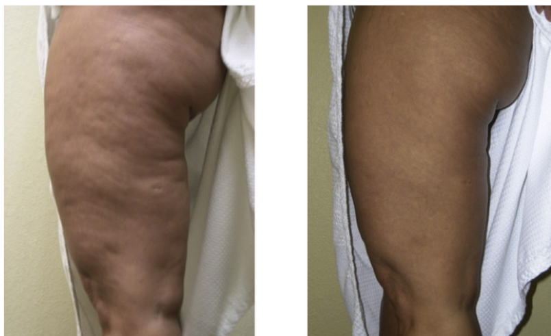
Fig. 2. Before (left) and after (right) one treatment in the buttocks with 1440 nm Cellulaze (photograph courtesy of Cynosure).

Collagenase enzymes isolated and purified from the fermentation of Clostridium histolyticum are used in clinical trials for the treatment of cellulite. Collagenase I (AUX-I; Clostridial class I collagenase) and Collagenase II (AUX-II; Clostridial class II collagenase) are not immunologically cross-reactive and have different specificities; mixed in a 1:1 ratio, they become synergistic and provide a very broad hydrolyzing reactivity toward collagen (Yang and Bennett, 2015). Thus, they can hydrolyze the triple-helical region of collagen and have the