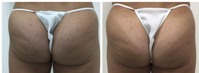
Fig. 4. Before (left) and after (right) five treatments in the buttocks with poly-L-lactic acid (one vial; photograph courtesy of Arruda Dermatology).