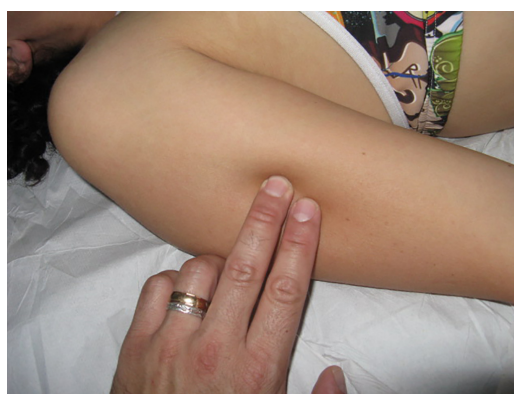
Figure 4 Fascial treatment of the radial nerve in the peripheral nervous system. Notes: A finger or fingers are placed on the nerve emergence in the middle third lateral of the humerus, where the radial nerve passes. The operator places his or her fingers on the fascial restriction identified previously by palpation, using different approaches, until the perceived resistance disappears or greatly decreases, inducing or stopping the preferential direction of the tissue.

direct trauma that might damage the radial nerve. 27–29 The method of treating any emergence of the peripheral nerve is relatively simple and noninvasive. Once the fingers are in contact with the emergence and the most superficial area of the nerve branches, a fascial osteopathic technique is used,