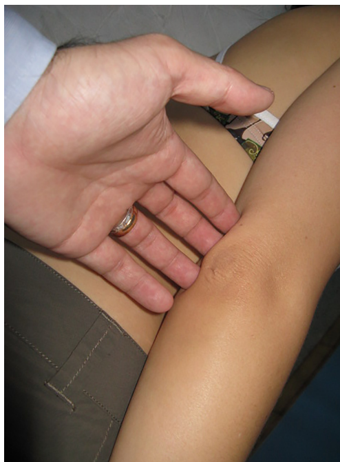
Figure 3 Fascial treatment of the ulnar nerve in the peripheral nervous system. Notes: A finger or fingers are placed on the nerve emergence at the elbow on the cubital tunnel, where it passes the ulnar nerve. The operator places his or her fingers on the fascial restriction identified previously by palpation, using different approaches, until the perceived resistance disappears or greatly decreases, inducing or stopping the preferential direction of the tissue.

Ulnar compression difficulties may be encountered at the cubital tunnel level, while the humeral area is subject to