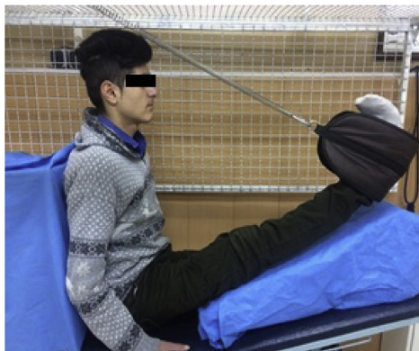
Fig. 5. Hamstring strengthening exercises in lengthened position.