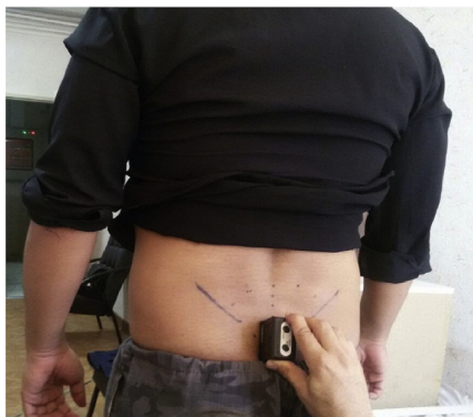
Fig. 2. Pelvic tilt angle measurement.